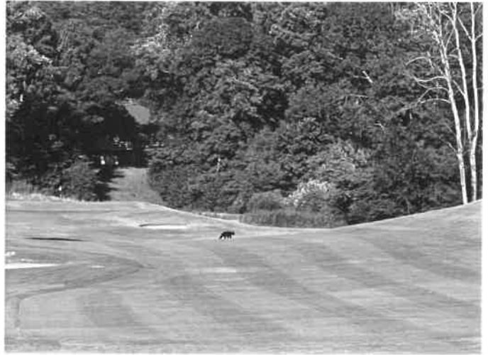
An unexpected visitor